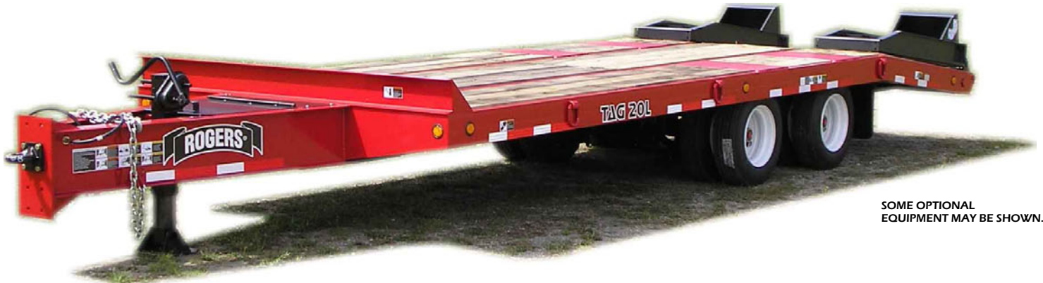
SOME OPTIONAL EQUIPMENT MAY BE SHOWN.

ROGERS® has two 20-ton models in the Tag-Along Series. Both have the variety of features that will make your job safer and easier. Choose from either the TAG20L and its 19'-0" level deck, or the TAG20XXL and its 22'-0" level deck. In these Tag-Alongs, ROGERS' superior construction means trouble-free service and dependable operation.